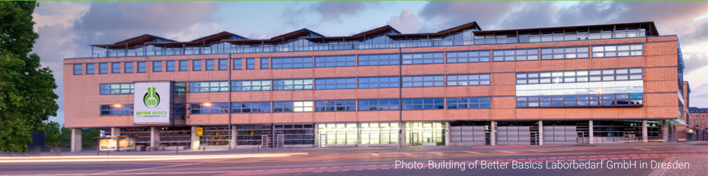
Photo: Building of Better Basics Laborbedarf GmbH in Dresden